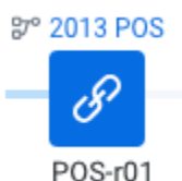
Figure: Reference dataset in a new flow

For more information, see Flow View Page .