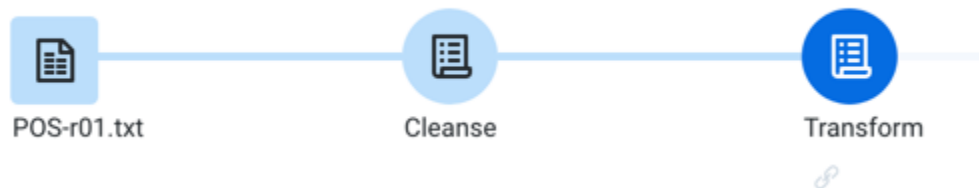
Figure: Chained recipes

The output of Cleanse recipe becomes the input of Transform recipe.