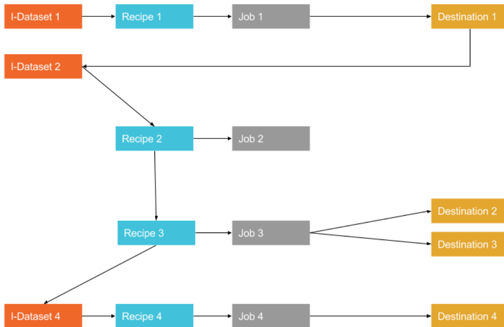
Figure: Flow Example