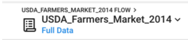
Figure: Click the Samples link.

At the top of the Transformer page, the type of the current sample is displayed next to the dataset name. To open the Samples panel, click the link. In the example below, the Full Data link indicates that the current sample in the Transformer page is the entire dataset: