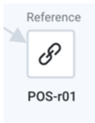
Figure: Reference Dataset icon in source flow

NOTE: A reference dataset is a read-only object in the flow where it is referenced. A reference dataset must be created in the source flow from the recipe to use. For more information, see View for Recipes .