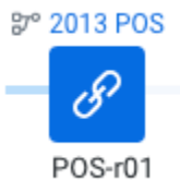
Figure: Reference dataset in a new flow

For more information, see Flow View Page .