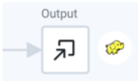
Figure: Output icon

Associated with each recipe is one or more outputs. These publishing destinations can be configured through the context panel in Flow View. Through outputs, you can execute and track jobs for the related recipe.