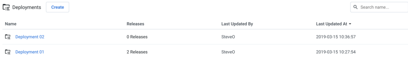
Figure: Deployment Manager

When you open the Deployment Manager, you can explore all of the deployments in the Production instance.