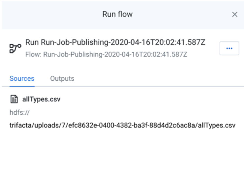
Figure: Flow task - Sources tab

Review the datasources for the task, including a full path to the source location.