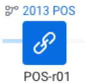
Figure: Reference dataset in a new flow

For more information, see Flow View Page .